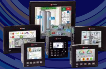
PLC & HMI